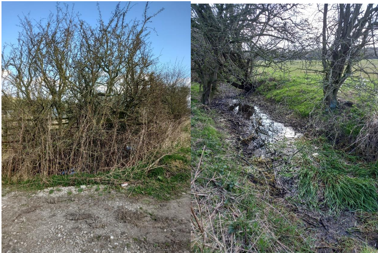
Elton Lane Ditch 1