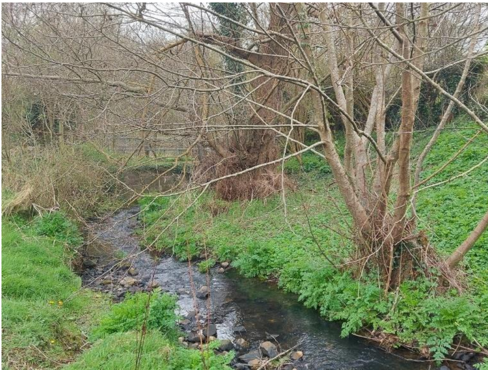
Wepre Brook Brookside reach