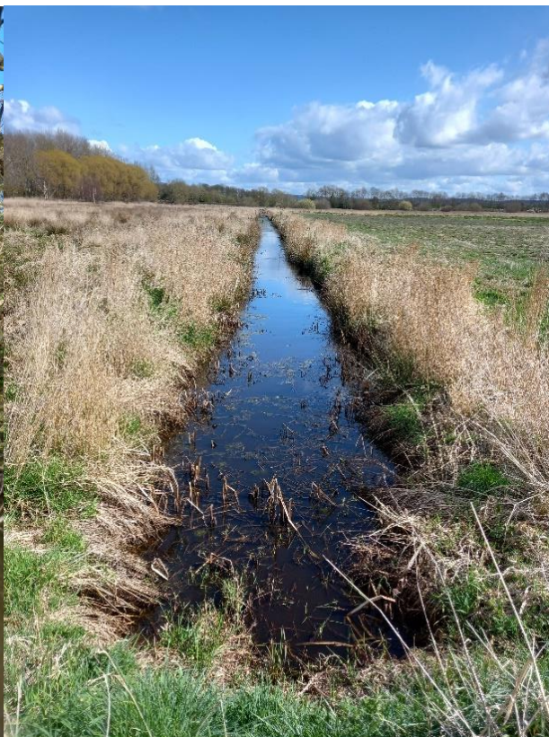
Thornton Ditch 4