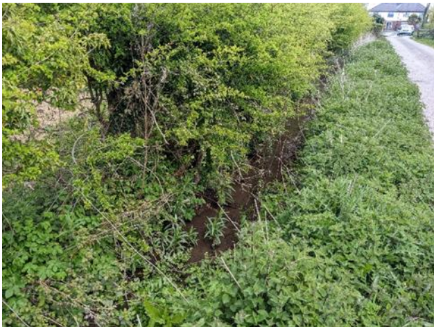
Mancot Brook - Downstream Reach